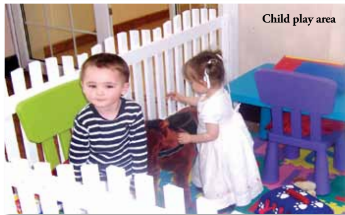
Child play area