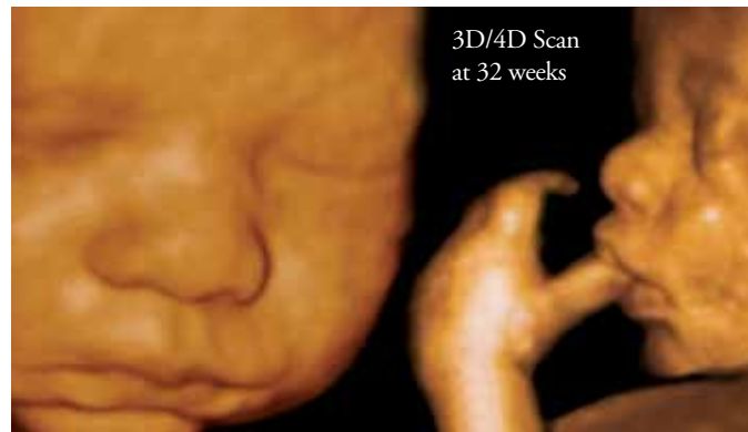
3D/4D Scan at 32 weeks

Lastly, we consider all our scans to be diagnostic and never scan just for entertainment. The health of you and your baby is our primary concern, therefore our NHS trained Sonographers will always perform a baby well-being progress report on all our scans which include some of the following: Examining the baby's heartbeat, placenta position, amniotic fluid content, estimated weight measurements, full growth measurements, anomaly examination and baby's presentation.