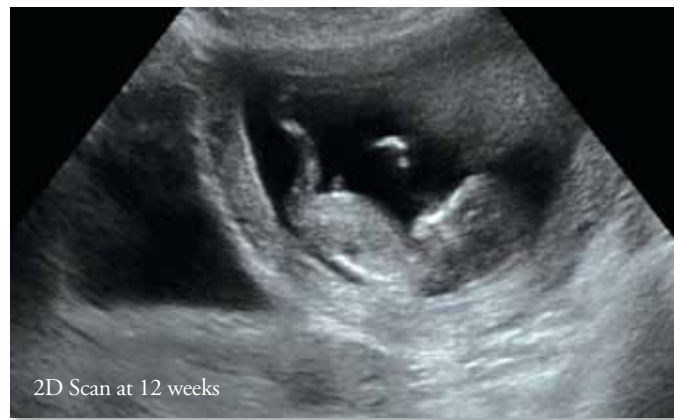
2D Scan at 12 weeks