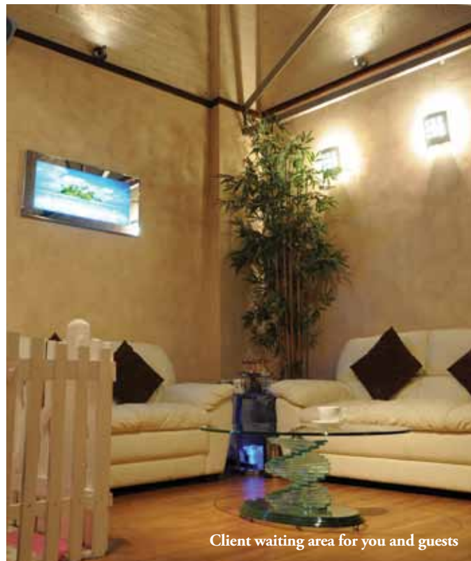
Client waiting area for you and guests

Before your scan, a member of our team will discuss with you the scanning process and what to expect. You can feel free at any time to ask any questions that you may have.