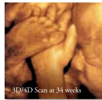
3D/4D Scan at 34 weeks

This service is for clients who wish complete privacy with no time limit to their appointment. These sessions are made outside our normal working days/hours to insure you have our studio to yourself. Please call for additional information.